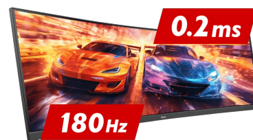
180Hz & 0.2ms MPRT

The Fast IPS panel technology guarantees not only high-fidelity, vivid battleground scenes displayed with outstanding colour accuracy but provides also an outstanding 0.2ms Moving Picture Response Time (MPRT).